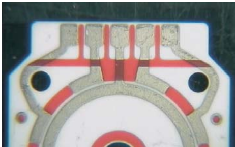
Printed Ceramic Element (Internal View)