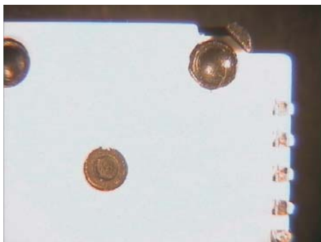
Ceramic Element (Bottom View)

Customers will see a visual change from a white ceramic element to a green FR4 element as illustrated in the photos below. This change in materials and technology enhances the reliability of the product and does not affect electrical or mechanical performance of the product.