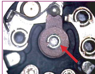
New design with rivet process

The changes to this product do not affect current compliance to RoHS requirements. This upgrade does not affect, form, fit or function.