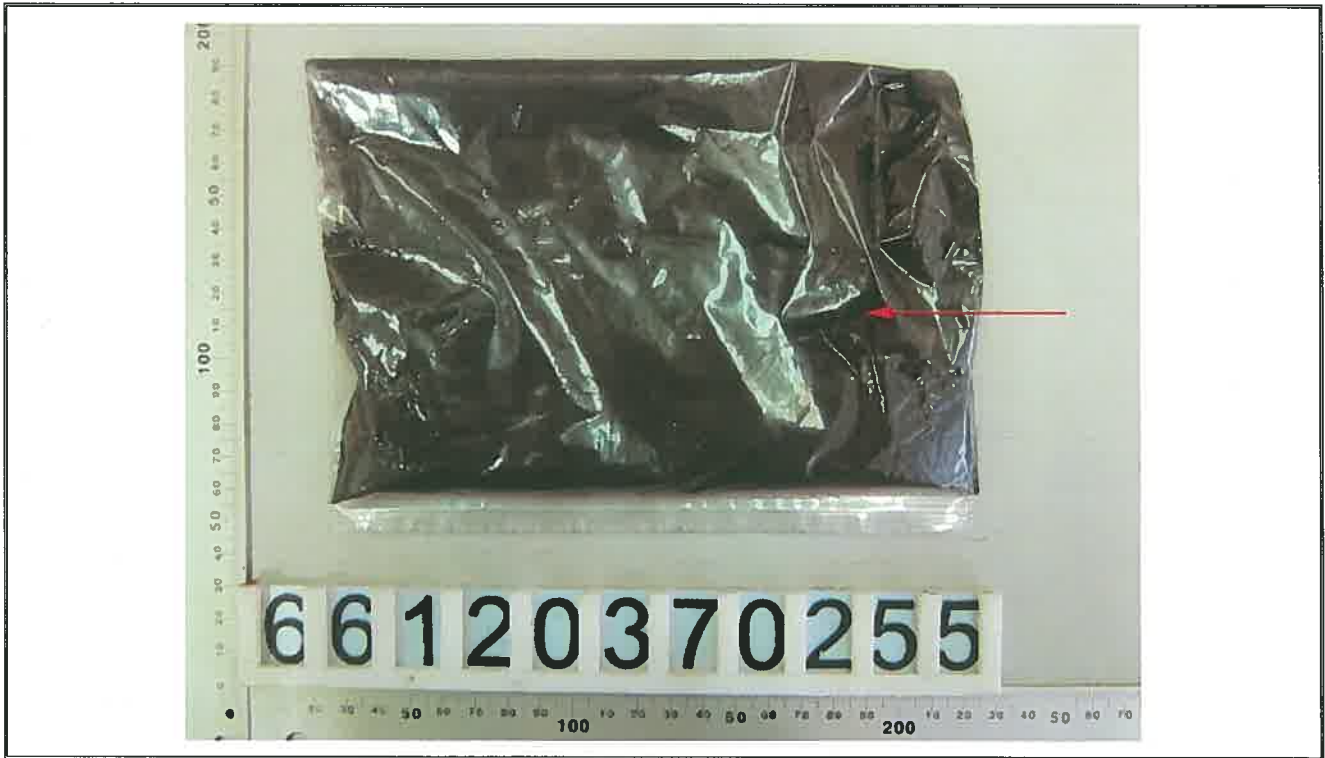
Photo of the Submitted Sample

LAB NO. : (6612)037-0255 DATE : February 10, 2012 PAGE : 2 OF 8