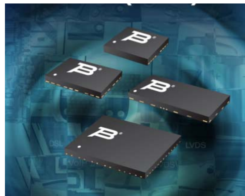
Photo on the right shows Bourns® TBU® Product Circuit Protection Component

Bourns, Inc. established in 1947 that distinguishes itself from the competitions with superior product quality, continuous innovation, excellent customer services, and nonstop efficiency improvement. Bourns provide the most comprehensive line of circuit protection technology and solutions for a wide variety of industries including automotive, industrial, instrumentation, medical electronics, consumer equipment, computers and peripherals, telecommunication and portable electronics.