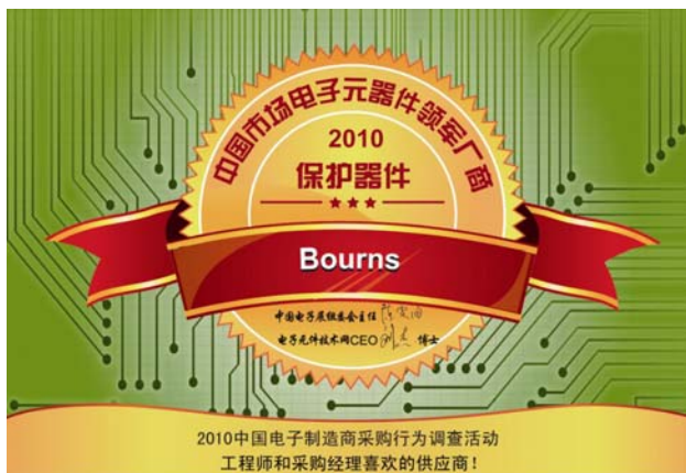
Photo on the left shows award logo of 2010 passive component leading supplier of circuit protection award

The evaluation was started on July 1, 2010 by Cntronic.com. They received 1720 responses to their questionnaire. The interviewee list included purchasing engineers, research and development engineers and decision makers. To select the outstanding supplier, all interviewees completed the questionnaire based on their experiences with the accepted supplier list. To highlight the impartiality and the specialization, the organizer invited Tier 1 Purchasing Managers to act as judges; Huawei and Flextronics were two of the participant companies. Candidate list verification and questionnaire results were judged by them.