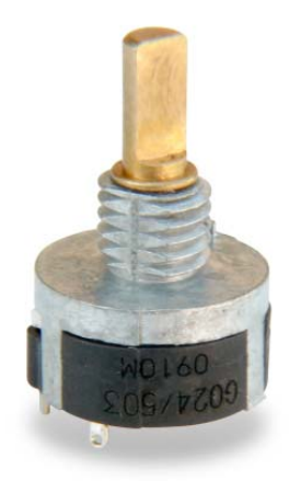
Laser print marking method

The change to laser marking will be implemented in production the week of May 4, 2009 starting with date code 0918.