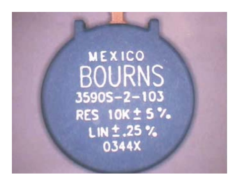
Ink print marking method

In line with our commitment to product excellence, Sensors & Controls is introducing a product marking improvement to all catalog models currently marked for identification with ink. The product upgrade utilizes laser-marking technology in place of marking ink. This change will improve piece part processing and provide end customers with a more durable marking. The photos below show the difference in marking.