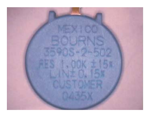
Laser print marking method

Please note that this change does not affect form, fit or function of the product. There will be no changes to current prices, minimum order quantities or multiples.