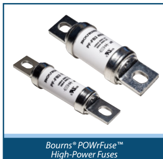
Bourns® POWrFuse™ High-Power Fuses