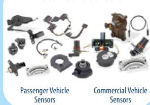
Passenger Vehicle Sensors