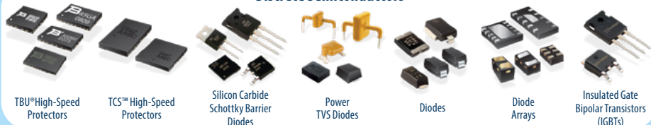
TBU® High-Speed Protectors