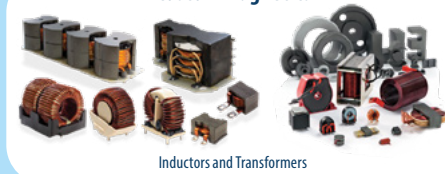
Inductors and Transformers