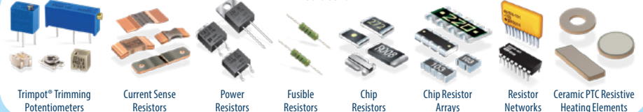
Trimpot® Trimming Potentiometers