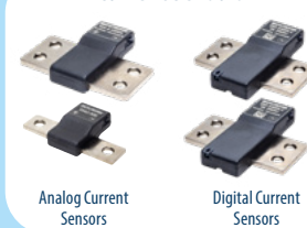
Analog Current Sensors