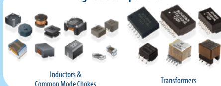
Inductors & Common Mode Chokes