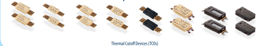
Thermal Cutoff Devices (TCOs)