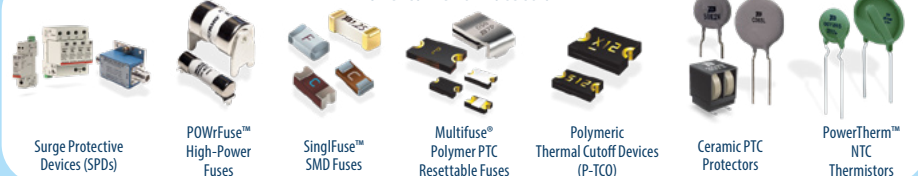
Surge Protective Devices (SPDs)