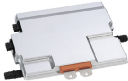
Stack Sensor Board

The synthesize function is used to discharge excess energy from fuel cells, ensuring that there are no overvoltage conditions which could potentially cause damage. The precision and thermal stability qualities of the thick film on steel technology offers state-of-the-art capabilities in managing excess energy discharge.