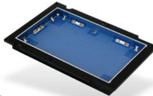
Figure 3: Inside view of ceramic housing