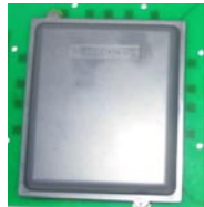
Figure 2: View of plastic housing mounted onto PCB